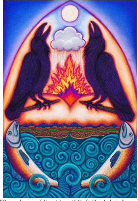
"Guardians of the Heart" Soft Pastel, 15" x 22"

I often begin with a thumbnail sketch that I transfer onto paper to enlarge the image, and then I work out further details from my original sketch. It's much like creating a pattern. I then transfer that image onto the final surface and begin to apply my color.