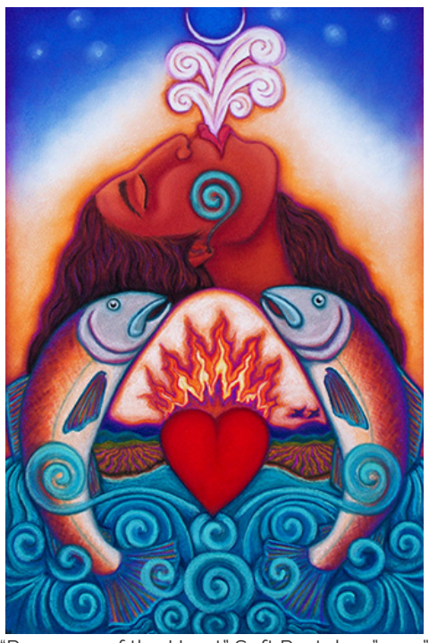
"Recovery of the Heart" Soft Pastel, 15" x 22"

I often begin with a thumbnail sketch that I transfer onto paper to enlarge the image, and then I work out further details from my original sketch. It's much like creating a pattern. I then transfer that image onto the final surface and begin to apply my color.