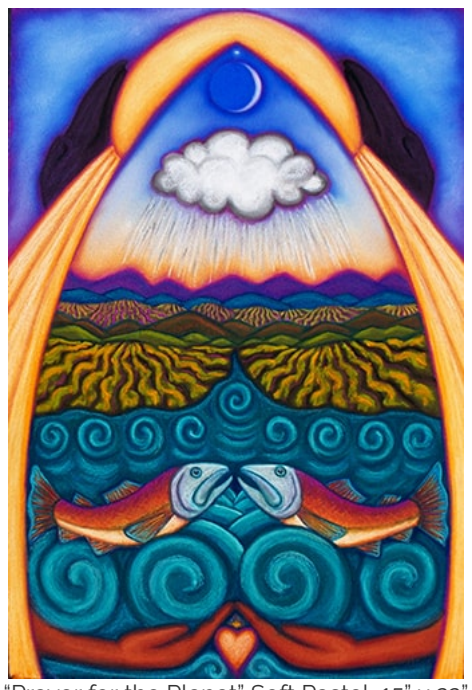
"Prayer for the Planet" Soft Pastel, 15" x 22"

It is very satisfying to work with the bright pure pigments that soft pastels offer. I can blend with my fingers or tools, layering in the colors, using the range of hard to soft sticks of pastels. This provides the hands-on tactile feel I so enjoyed when I used to work with clay. I also work with acrylics from time to time. I find it both challenging and stimulating to shift my process, medium and the surface I normally use.