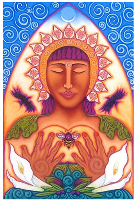
"Fig Queen Bee" Soft Pastel, 15" x 22"

It is very satisfying to work with the bright pure pigments that soft pastels offer. I can blend with my fingers or tools, layering in the colors, using the range of hard to soft sticks of pastels. This provides the hands-on tactile feel I so enjoyed when I used to work with clay. I also work with acrylics from time to time. I find it both challenging and stimulating to shift my process, medium and the surface I normally use.