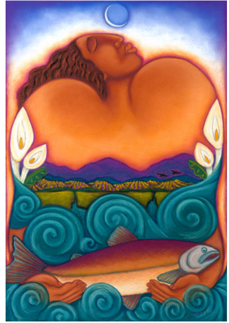
"Sacred Salmon" Soft Pastel, 15" x 22'

My imagery is often set in fertile fields or vineyards, paying homage to my Kansas roots and upbringing along with my time in Skagit Valley, Washington, and northern California. These narratives are a spiritual journey for me. The storytelling that comes full circle with the viewers' response and their experience of a piece is often far more interesting than my own. These can become seeds planted where new images come forth. A series is formulated and one painting leads into the next.