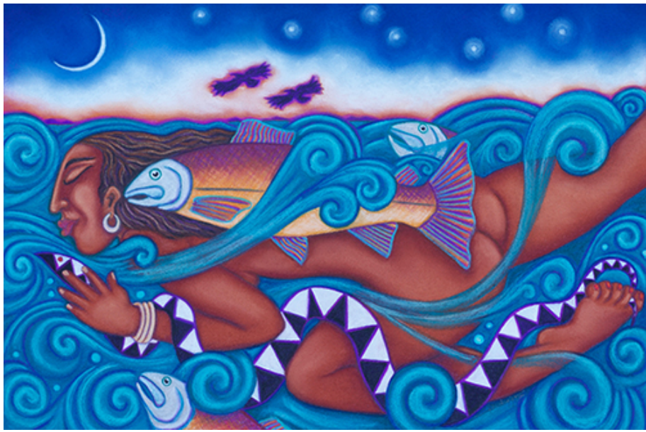
"Symbolic Journey" Soft Pastel, 22" x 15"

I love bold color, repeating patterns and symmetry. While growing up, I watched my mother, who was an incredible seamstress, work with patterns and colorful fabric. Her process and love of color has influenced the way I work.