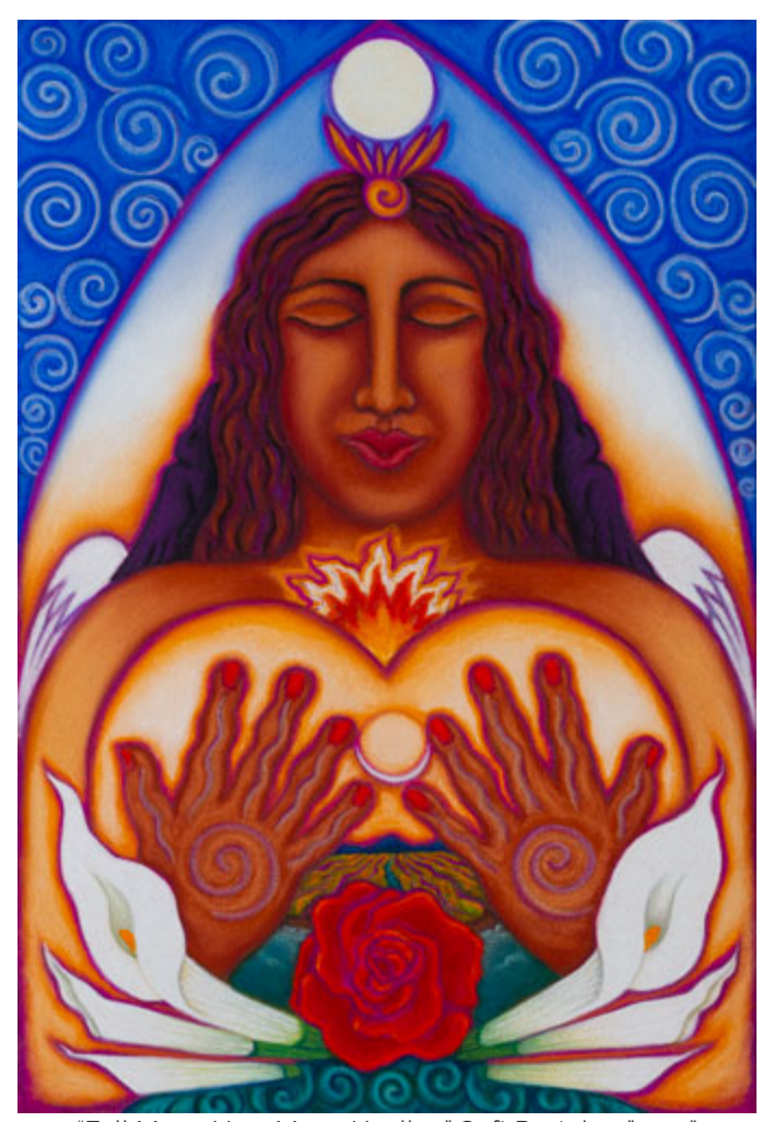
"Full Moon New Moon Healing" Soft Pastel, 15" x 22"

My concerns for the planet influence my work and imagery. Goddess-like figures are often featured holding the Earth in a protective or nurturing embrace. For me, it's like a prayer that holds all life in a sacred space. This focus has encouraged me to participate in a group of local artists called the Mendocino Eco Artists. We exhibit to support local eco organizations, promote education and awareness.